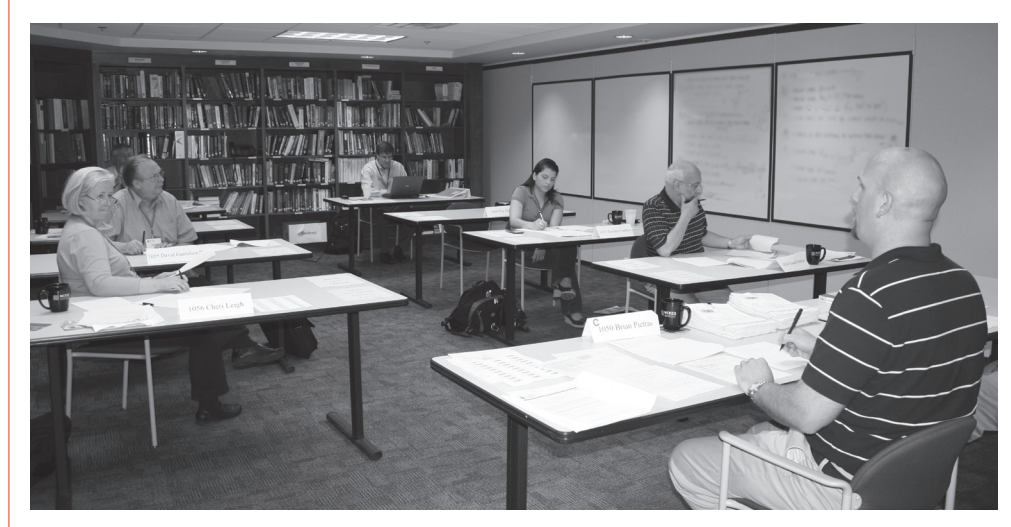
NCEES held a scoring workshop on June 9–11 at its headquarters in Clemson, with 85 structural engineers from across the country taking part. These volunteers were all structural engineers licensed to practice in their jurisdiction.

NCEES held a scoring workshop on June 9–11 at its headquarters in Clemson, with 85 structural engineers from across the country taking part. These volunteers were all structural engineers licensed to practice in their jurisdiction. The team reviewed the