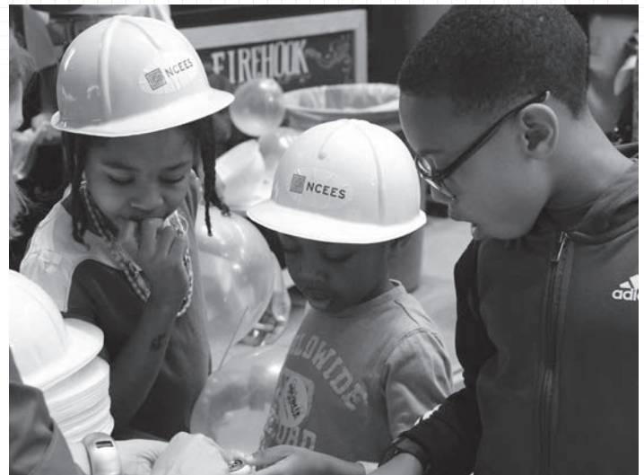
Children at DiscoverE Family Day get a lesson in using a compass as part of the NCEES X Marks the Spot activity. NCEES volunteers promoted engineering and surveying at the Washington, D.C., event, which attracted more than 8,000 children, parents, and educators in 2016.

In every organization, one of the most important jobs of the leader is to develop more leaders. The same is true in engineering and surveying. There is a continuing need for licensed engineers and surveyors to love and respect our professions and to ensure their future. A crucial aspect of that is to find the best young people and appeal to them to become world-class engineers and surveyors, ensuring that they know, firsthand from you, the ultimate value of being a licensed professional.