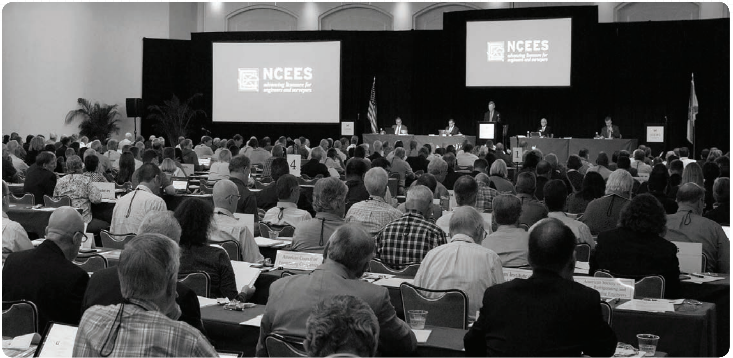
Delegates prepare to vote on motions at the 2017 NCEES annual meeting. NCEES member boards meet each year to consider motions related to issues such as licensing exams and the organization's model laws and rules.

standards by all of our member boards would be a step in the right direction.