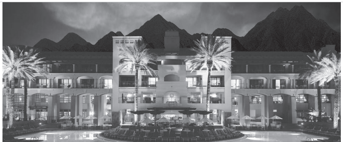
The 97th NCEES annual meeting will be held August 15-18 at the Fairmont Scottsdale Princess hotel in Scottsdale, Arizona.

Postmaster: Send address changes to Licensure Exchange , P.O. Box 1686, Clemson, SC 29633-1686