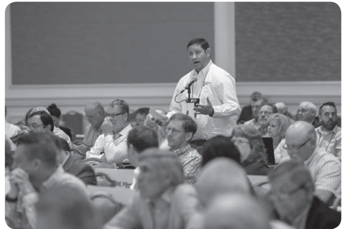
A representative of the Utah board debates the merits of a motion at the third business session of the 2019 NCEES annual meeting.