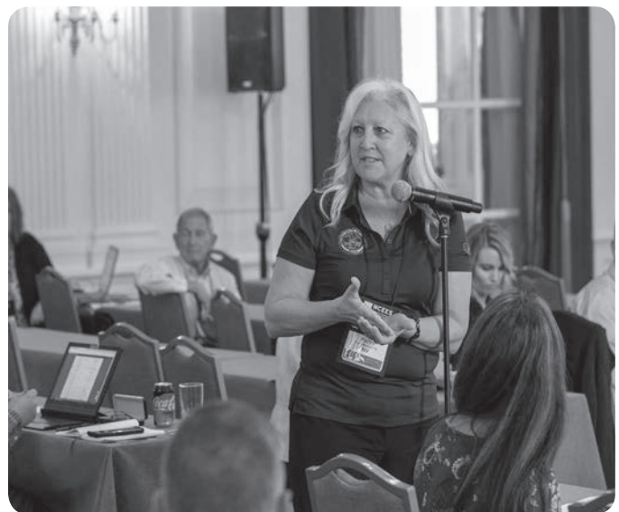
Top: Delegates discuss ethics in professional practice at a professional development workshop at the 2019 NCEES annual meeting. Bottom: MBAs use their Thursday forum to confer with each other on topical issues. NCEES offered workshops and forums on Wednesday and Thursday for delegates to learn about and discuss issues affecting the professions of engineering and surveying.

Examinations for Professional Surveyors be professional surveyors and that the Committee on Member Board Administrators chair be an MBA and that its members include at least two MBAs from each zone.