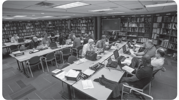
Volunteers with the Fundamentals of Engineering Exam Development Committee collaborate on writing new exam items.

One of the driving reasons behind our headquarters relocation is to provide better exam volunteer space and an improved experience. Most of the first floor of our new building will be retrofitted specifically for our exam volunteers' needs. We will have five separate computer labs with 20 permanent working stations each, including large monitors to better replicate the computer-based testing environment. Two of the labs will have air walls so that they