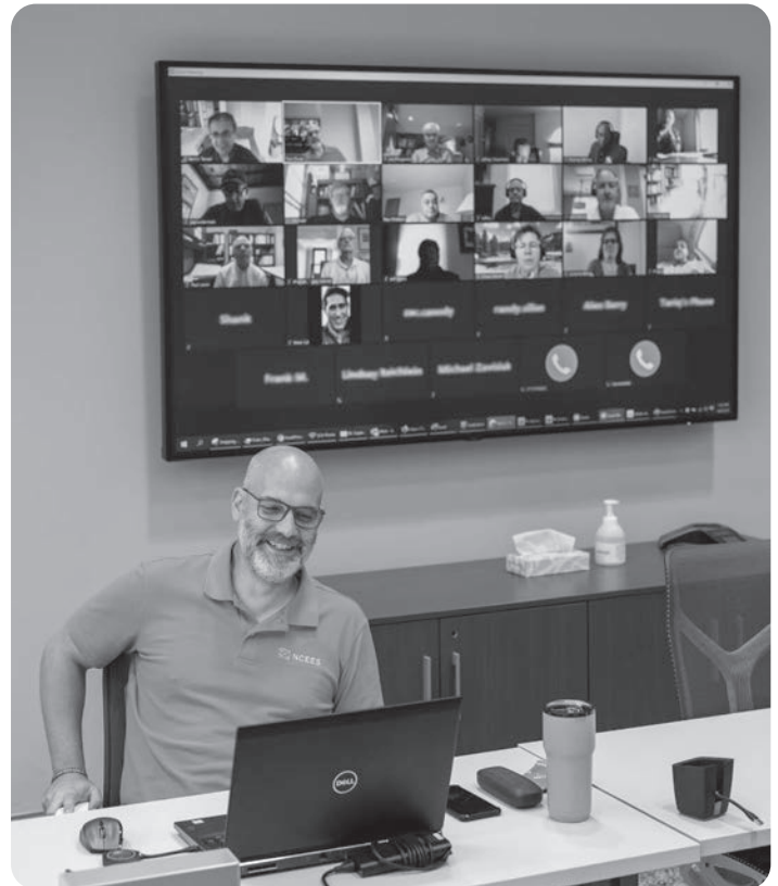
The PE Environmental exam development committee meets virtually in September 2020. NCEES moved to remote meetings to keep its exam development program moving forward during the COVID-19 pandemic.

The PE Structural committee also met virtually in December to grade the October 2020 constructed response papers,