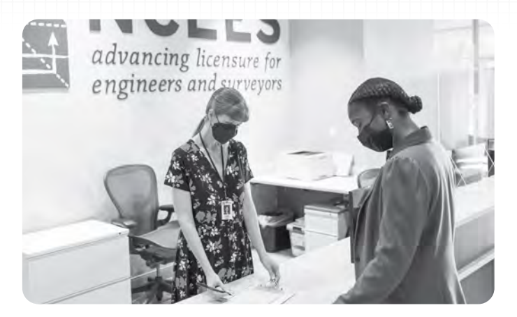
NCEES staff member welcomes a PE Mechanical exam volunteer to NCEES headquarters in Greenville, South Carolina. The PE Mechanical meeting in October was the second in-person exam development meeting held at NCEES since March 2020.

Limiting the types of calculators allowed in the exam room is one measure NCEES takes to protect exam integrity.