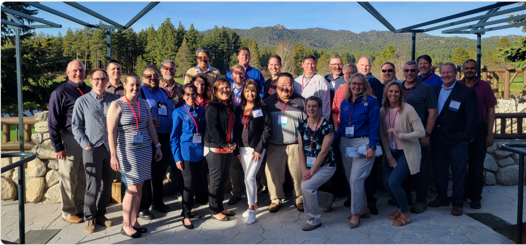
Western Zone delegates and NCEES leadership gather outside the Edgewood Tahoe Resort in Stateline, Nevada, at the First-Time Attendee Reception during the zone's interim meeting. The May 19–21 gathering was the last of the spring interim meetings for the four NCEES zones.

WELL, THAT WAS FUN! FOR THE FIRST TIME IN WHAT seems like forever, we were able to meet together, in person, to conduct our zone business and hear the reports from all our standing committees and task force.