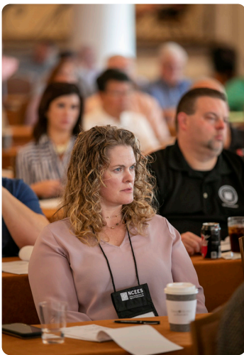
Attendees of the 2019 NCEES annual meeting's Law Enforcement Program learn about investigative techniques using social media sites.

Online registration is open until July 8 for the 2022 Law Enforcement Program at the annual meeting. This program is part of the 101st NCEES annual meeting, which will be held August 23–26 in Carlsbad, California.