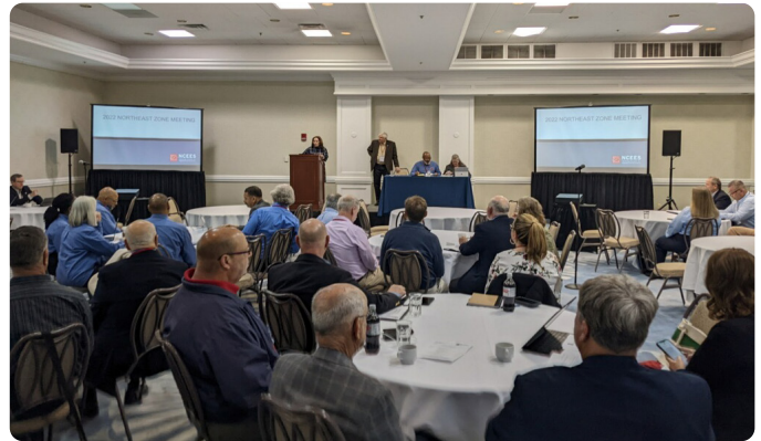
Delegates listen to reports at the 2022 Northeast Zone interim meeting. The four NCEES zones held interim meetings in April and May to conduct zone business and prepare for the annual meeting in August.