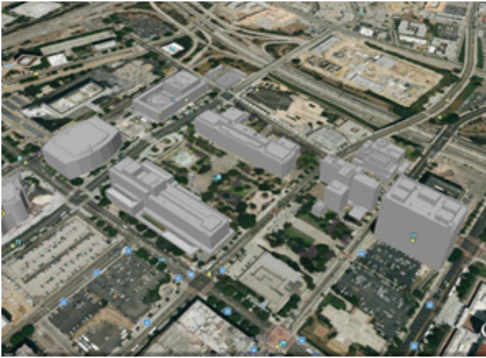
3D City Models - LA County, Google