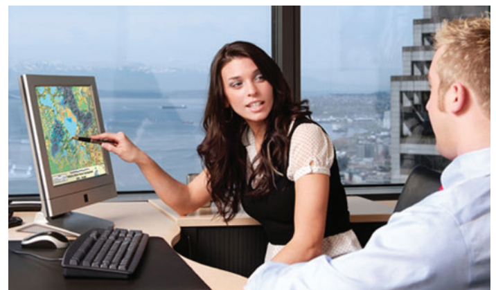
Geographic Information System (GIS)

See other student clubs and organizations at dessa.fau.edu/clubs.php .