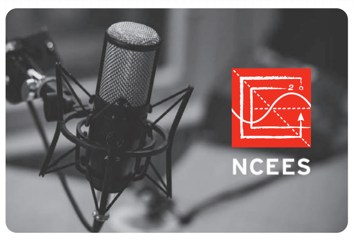
To further its virtual outreach, NCEES launched "Advance: An NCEES Podcast Series" in September 2020.

While the COVID-19 pandemic has transformed how we live and work this past year, we remain hopeful for progression toward a positive resolution and a return to normal in 2021. We will continue to serve our member boards, professional engineers and surveyors,