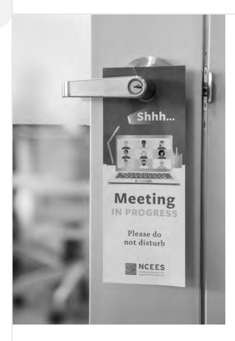
The 2022 MBA meeting has moved to a virtual format in response to an increase in COVID-19 cases. Originally scheduled to be held at NCEES headquarters, the meeting will now be conducted via Zoom on February 3.

Postmaster, send all address changes to NCEES, 200 Verdae Boulevard, Greenville, SC 29607-3900