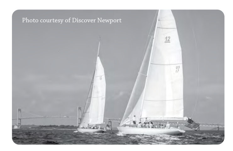
The Northeast Zone will hold its interim meeting April 28-30 in Newport, Rhode Island. The Central and Southern zones will hold a joint interim meeting April 21–23 in Oklahoma City, Oklahoma, and the Western Zone will host its 2022 zone interim meeting May 19–21 in Stateline, Nevada.

Also on the agenda is zone business, including selecting officers. The Central and Western zones will elect vice presidents and assistant vice presidents, while the