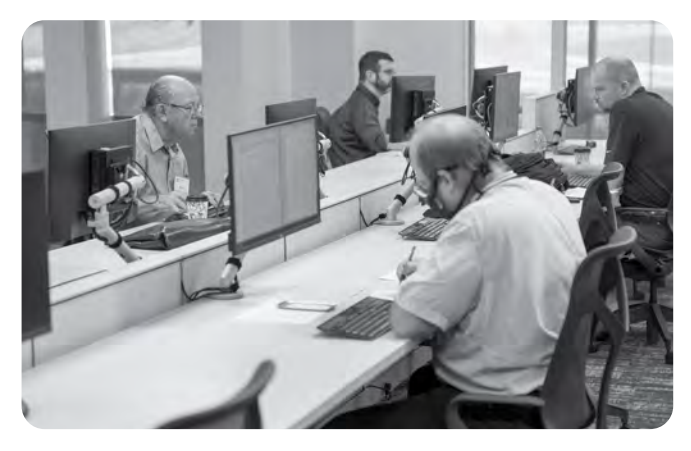
Volunteers with the PE Mechanical exam development committee write new exam items. The exam completed its transition to CBT in 2020.