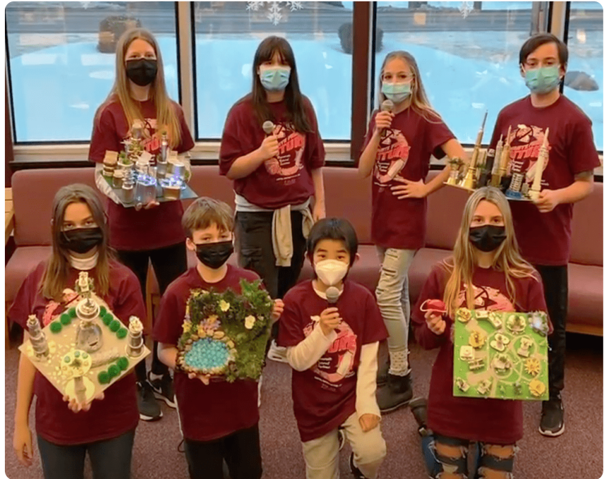
Team members from Richard O'Rourke Middle School in Albany, New York, display their future city, Cyclosparta. The team won the NCEES-sponsored Best Land Surveying Practices special award at the 2022 Future City finals.

NCEES is seeking judges for the NCEES Best Land Surveying Practices special award for Future City regional competitions across the country in January. The Best Land Surveying special award recognizes the design that employs the best land surveying practices, taking into consideration the high standards used by surveyors to protect the public's health, safety, and welfare.