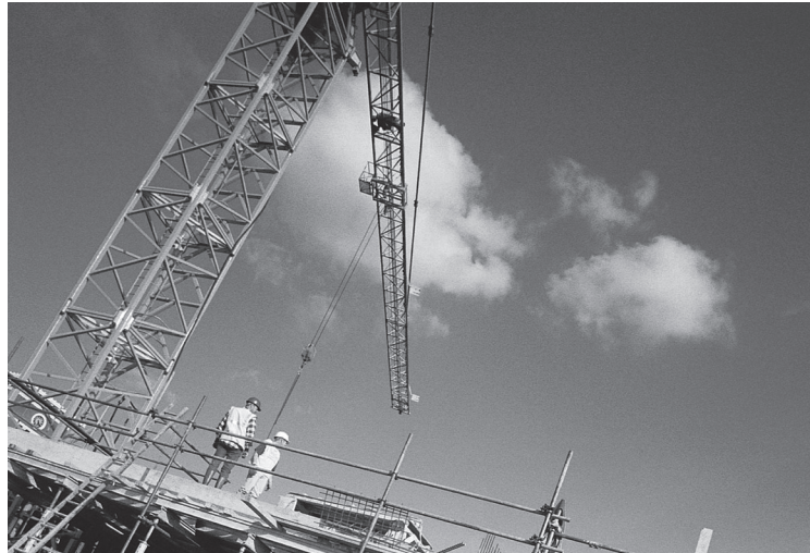
The new NCEES position statement on tower cranes recommends measures to ensure the safety of workers and the general public.