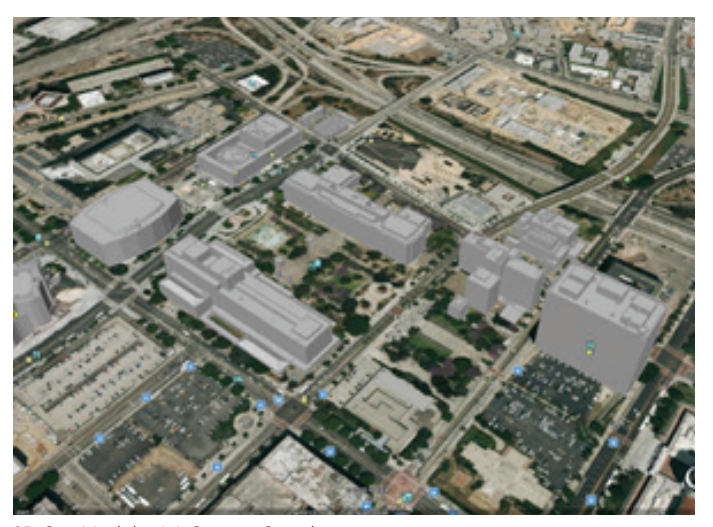
3D City Models - LA County, Google