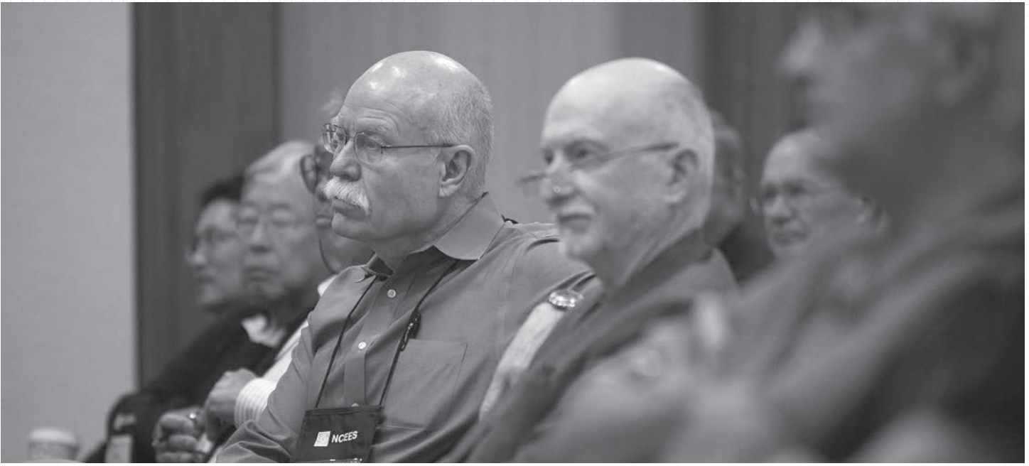
Delegates at the 2016 NCEES annual meeting learn about using ethical decision-making skills during a professional ethics workshop. The workshop was one of two ethics-related sessions that the organization offered at the meeting as part of its efforts to promote professional ethics for all engineers and surveyors.

the choice to practice outside your capability as determined by education or experience. The board is very serious about its duty to protect the public, as that is the justification for the board's existence. And if you routinely practice outside your field of expertise, there is a high likelihood you will have a complaint filed against you at some time. If you are found guilty, you could lose your license or have it suspended. Practice within your area of expertise, and to the best of your ability, to avoid trouble.