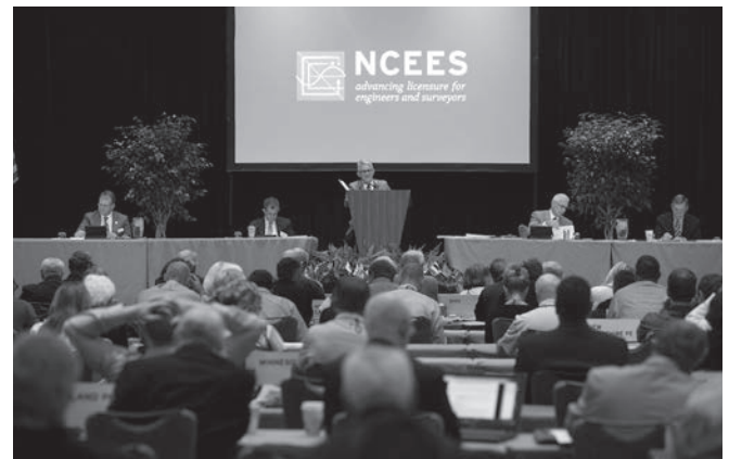
Delegates prepare to begin the business sessions of the 2016 NCEES annual meeting. Two-hundred eighty-seven delegates representing 66 licensing boards attended the meeting in Indianapolis, Indiana.

Delegates also approved an amendment to the financial policy on exam charges to require that examinees pay NCEES directly for all exams, whether CBT or pencil-and-paper format, beginning May 2017. Direct payment to NCEES is already required for all CBT exams. With PE exams moving from pencil-and-paper to CBT, the change will provide a consistent payment method during the transition.