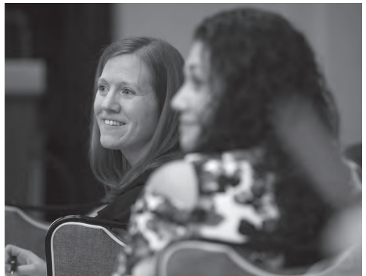
Top: Members of the Puerto Rico delegation follow the debate during Friday's opening business session. Below: Member board administrators at the 2017 NCEES annual meeting join in the MBA forum discussion. Forums for engineers, surveyors, and MBAs were held Thursday and a law enforcement forum was held Friday to provide opportunities for discussion of issues related to the professions.