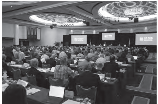
Delegates prepare to begin the business sessions of the 2017 NCEES annual meeting. Two-hundred eighteen delegates, representing 69 licensing boards, attended the meeting in Miami Beach, Florida.